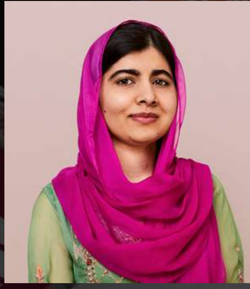
Malala Yousafzai PAKISTANI EDUCATION ACTIVIST