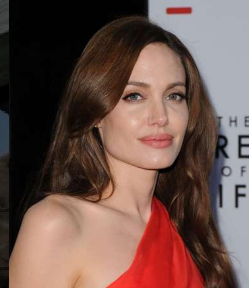
Angelina Jolie AMERICAN ACTRESS & UNICEF AMBASSADOR