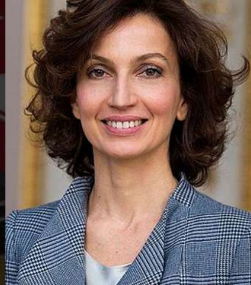
Audrey Azoulay UNESCO DIRECTOR-GENERAL