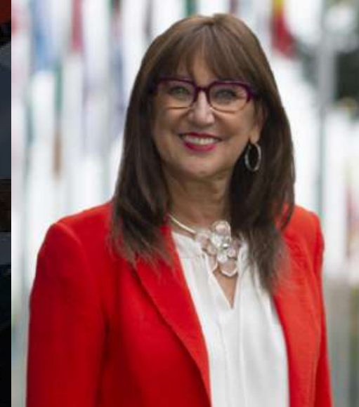
Rebeca Grynspan UNCTAD DIRECTOR GENERAL & COSTA RICAN POLITICIAN