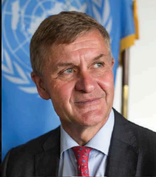
Erik Solheim FORMER UNEP DIRECTOR & NORWEGIAN MINISTER OF THE ENVIRONMENT