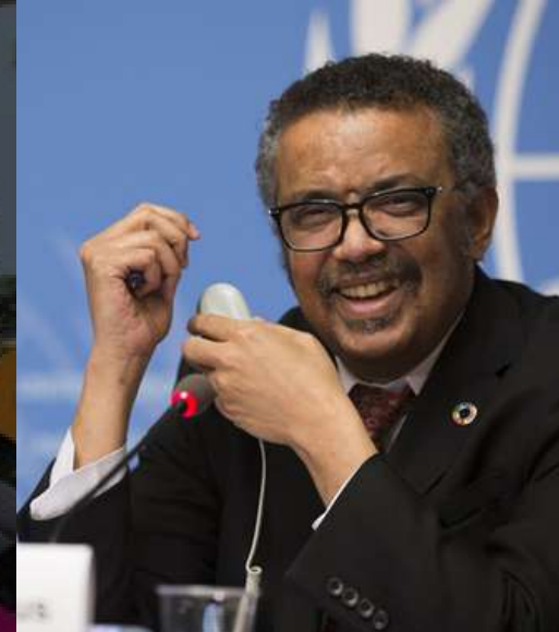
Tedros Adhanom Ghebreyesus WHO DIRECTOR-GENERAL