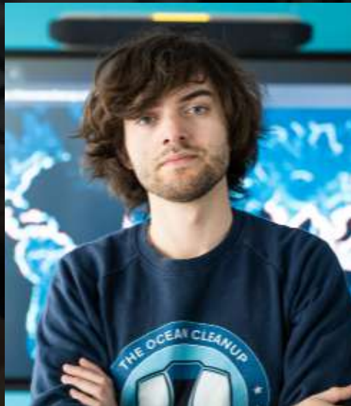
Boyan Slat DUTCH FOUNDER OF THE OCEAN CLEANUP