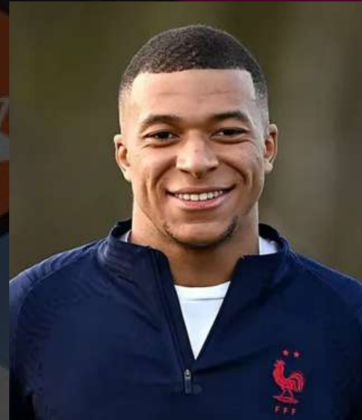
Kilian Mpappé FRENCH FOOTBALL PLAYER & INSPIRED BY KM