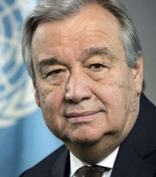
António Guterres UNITED NATIONS SECRETARY GENERAL