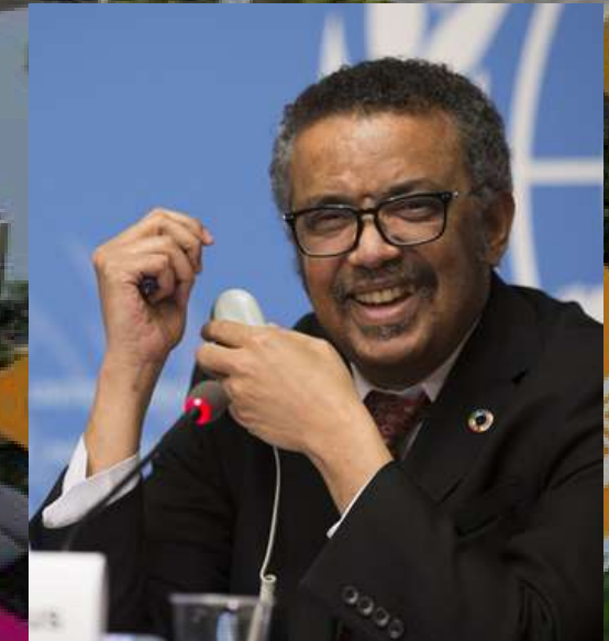
Tedros Adhanom Ghebreyesus

UNCTAD DIRECTOR GENERAL & COSTA RICAN POLITICIAN