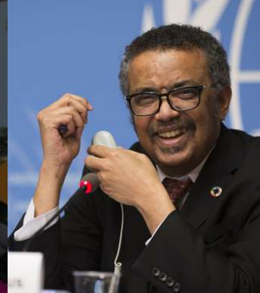
Tedros Adhanom Ghebreyesus

UNCTAD DIRECTOR GENERAL & COSTA RICAN POLITICIAN